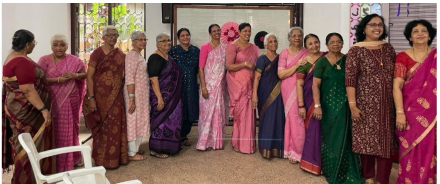
Below: Our lady members celebrating the Womens' Day One of the stops we made